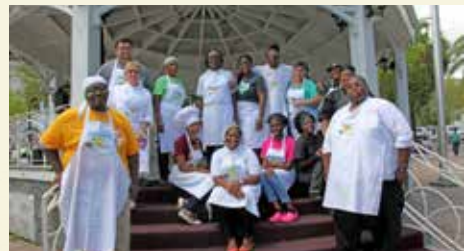
This year's participating chefs.