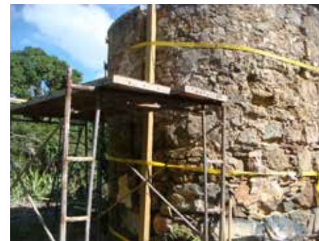
Figure 1 Stabilization of structure

consistency and ingredients. Stone Masonry LLC, a local business with extensive experience doing historical restoration on St. Thomas and St. John, was awarded the contract. Work on the kiln began in December, 2014.