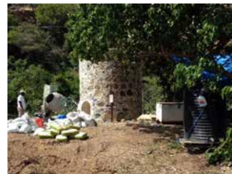
Figure 2 Restoration in progress

The structure was carefully braced, with wood, with ties, and with a stabilizing collar at the top and around the base of the kiln, so that no additional damage would occur. Masons worked to replicate the original design and materials.