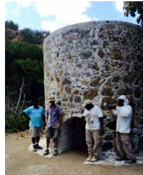
Figure 3 The Stone Masonry Crew

Although early lime kilns were frequently fired by wood, chunks of coal as well as coral and shells were discovered during this restoration, confirming coal as a heat source.