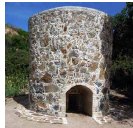
Figure 4 The Lime Kiln Restored

One clue comes from the imprinted firebrick that lined the kiln's interior, stamped with a date of 1851. The kiln may be from that date or earlier, as the interior could originally have been lined with limestone or a similar material, with the firebrick applied later to restore it for a longer life.