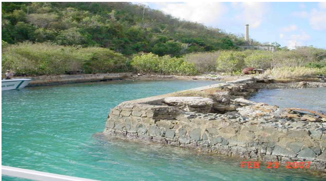
Creque Marine Railway and Head House before