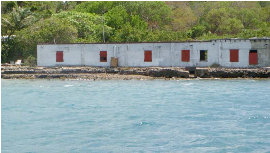
Regina Maris after clearing