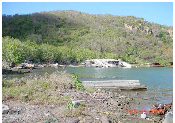
Manfred Compound before clearing