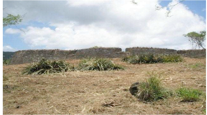
Ft. Shipley curtain wall after