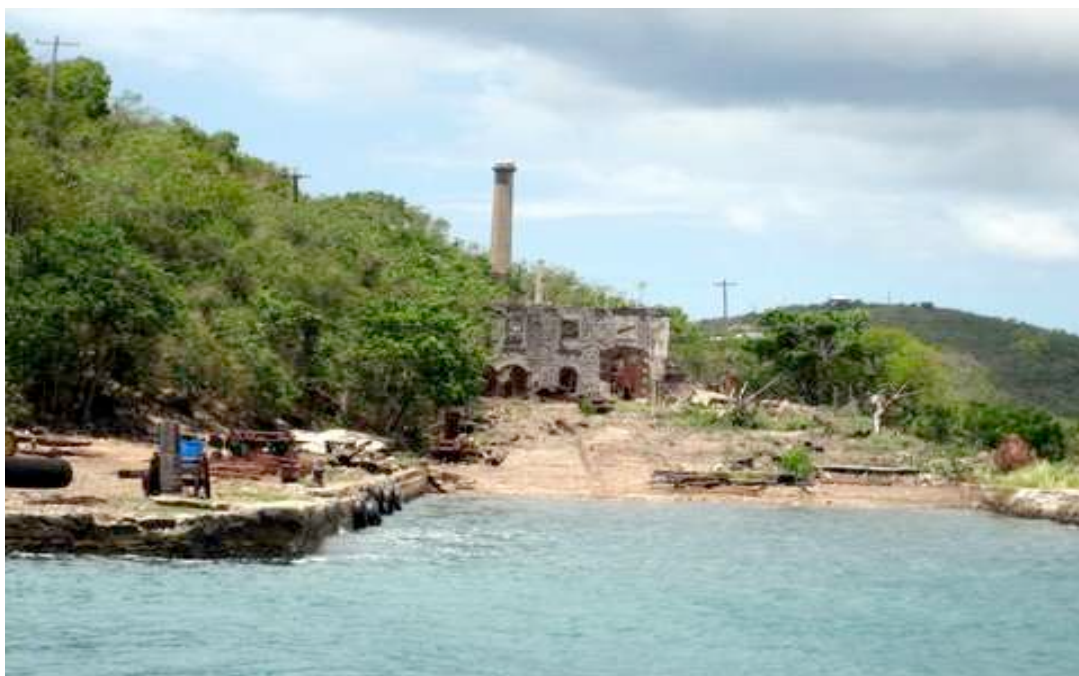
Creque Marine Railway and Head House after clearing