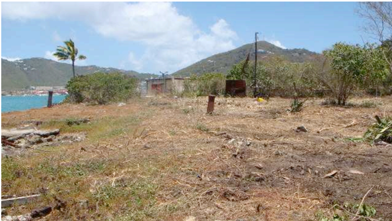
Manfred Compound after clearing