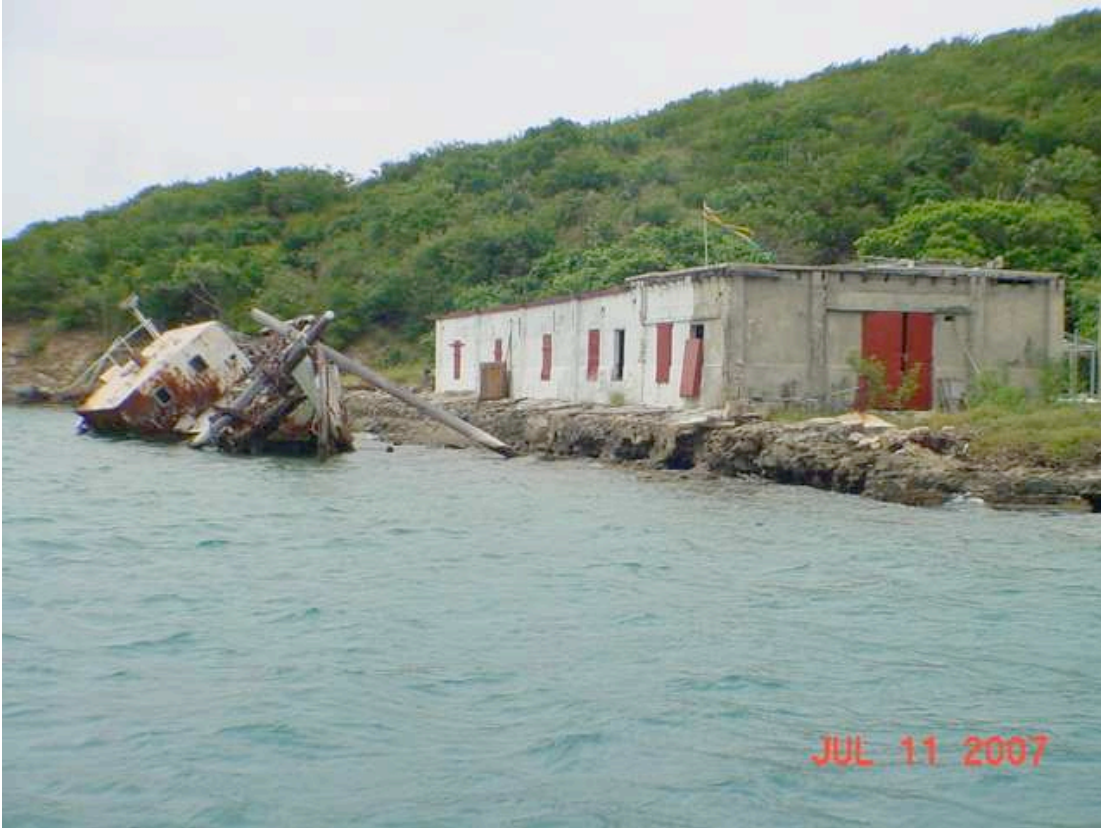
Regina Maris before