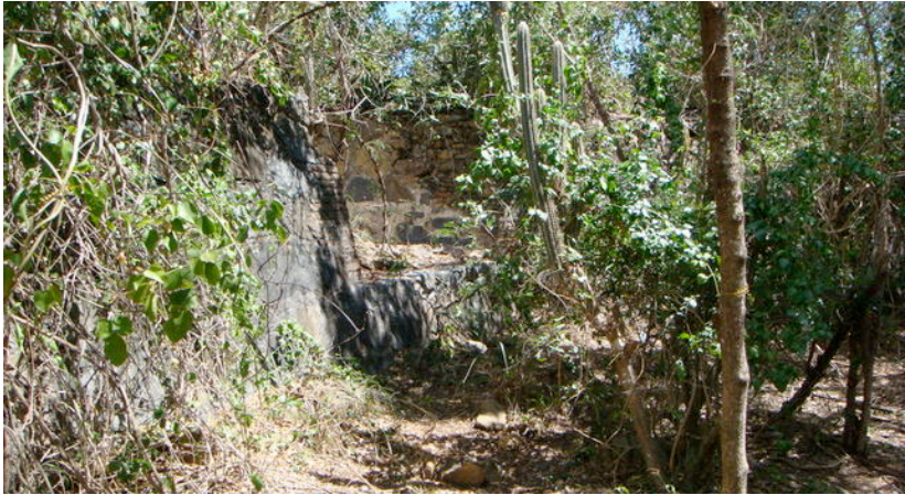
Ft. Shipley curtain wall before