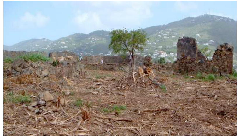
Ft. Shipley guardhouse after