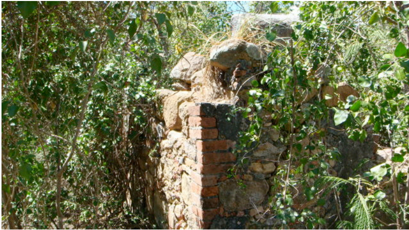
Ft. Shipley guardhouse before