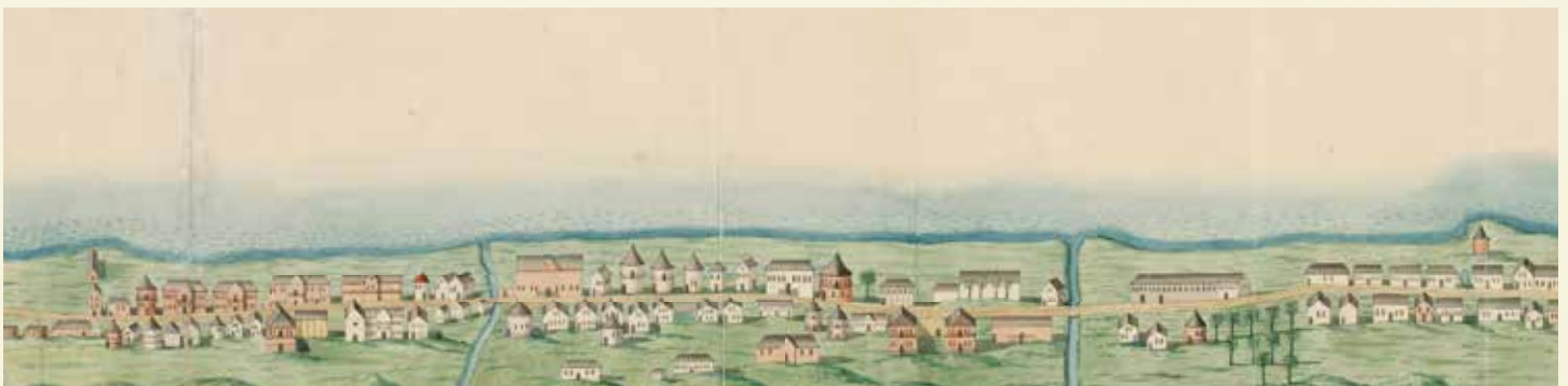
Charlotte Amalie in the 1700's showing the many wooden structures which were eventually destroyed in the 1804 fire.

Tradesmen arrived from St. Croix and from the English Islands, especially carpenters and masons. There was much activity. American ships brought lumber and shingles, and the European vessels came laden with bricks. All sorts of ironware were brought in vessels from Liverpool. More and more Muhlenfels assigned responsibility to Peter and the young man took pleasure in carrying out the assignments. The streets laid out by Muhlenfels were much broader than formerly, and there were cross lanes, passages, small parks. Large houses were being built on both sides of Main Street subject to the discipline of design, spacing and height controls established by Muhlenfels.