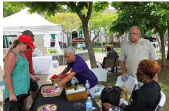
Coal Pot Cook Off volunteers from the VI Department of Tourism and The St Thomas Historical Trust.