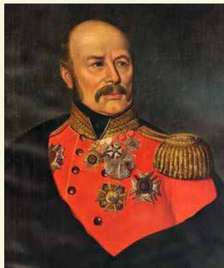
Portrait of Peter von Scholten

Once the fire got out of control there was nothing that anyone could do but stand helplessly by and watch a