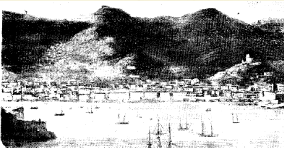
City of Charlotte Amalie before the great fire.