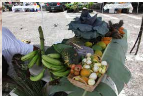
Local Farmers displayed and sold their produce. All Coal Pot ingredients were locally sourced from these farmers.