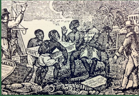
Workers Unloading Ice

Networks of ice wagons were typically used during the 1800's to distribute large blocks of ice to island homes and businesses. The ice had been cut from the surface of ponds and streams in New England, and stored in ice houses there before being packed in sawdust and sent on by ship to the Southern US, and islands in the Caribbean.