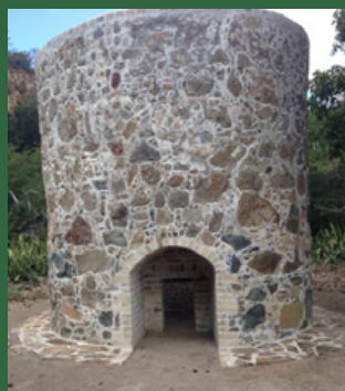
AFTER Renovations funded by the Trust.