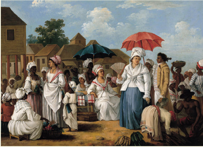
“Linen Market” (ca 1775) A Brunias, oil on canvas

How did Charlotte Amalie residents keep cool in centuries past? With no electricity to power fans or air conditioning, resourcefulness was needed! Here’s how townspeople coped with the tropics’ high heat, especially in summer and on airless autumn days.