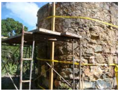
Figure 1 Stabilization of structure

consistency and ingredients. Stone Masonry LLC, a local business with extensive experience doing historical restoration on St. Thomas and St. John, was awarded the contract. Work on the kiln began in December, 2014.