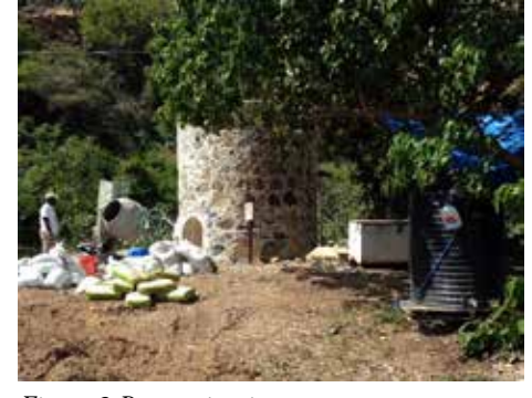
Figure 2 Restoration in progress

The structure was carefully braced, with wood, with ties, and with a stabilizing collar at the top and around the base of the kiln, so that no additional damage would occur. Masons worked to replicate the original design and materials.