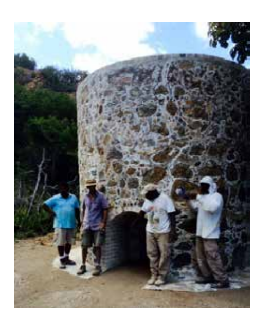
Figure 3 The Stone Masonry Crew

Although early lime kilns were frequently fired by wood, chunks of coal as well as coral and shells were discovered during this restoration, confirming coal as a heat source.