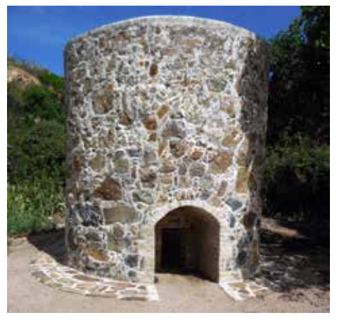
Figure 4 The Lime Kiln Restored

One clue comes from the imprinted firebrick that lined the kiln's interior, stamped with a date of 1851. The kiln may be from that date or earlier, as the interior could originally have been lined with limestone or a similar material, with the firebrick applied later to restore it for a longer life.